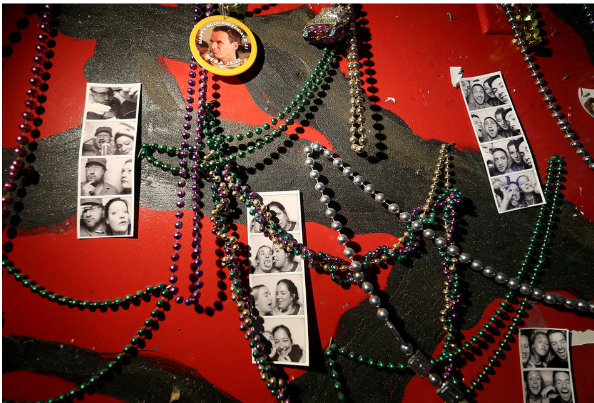
Photos and beads on the wall at the Mayfair Lounge on Amelia Street. Photographed on Wednesday, October 3, 2018.