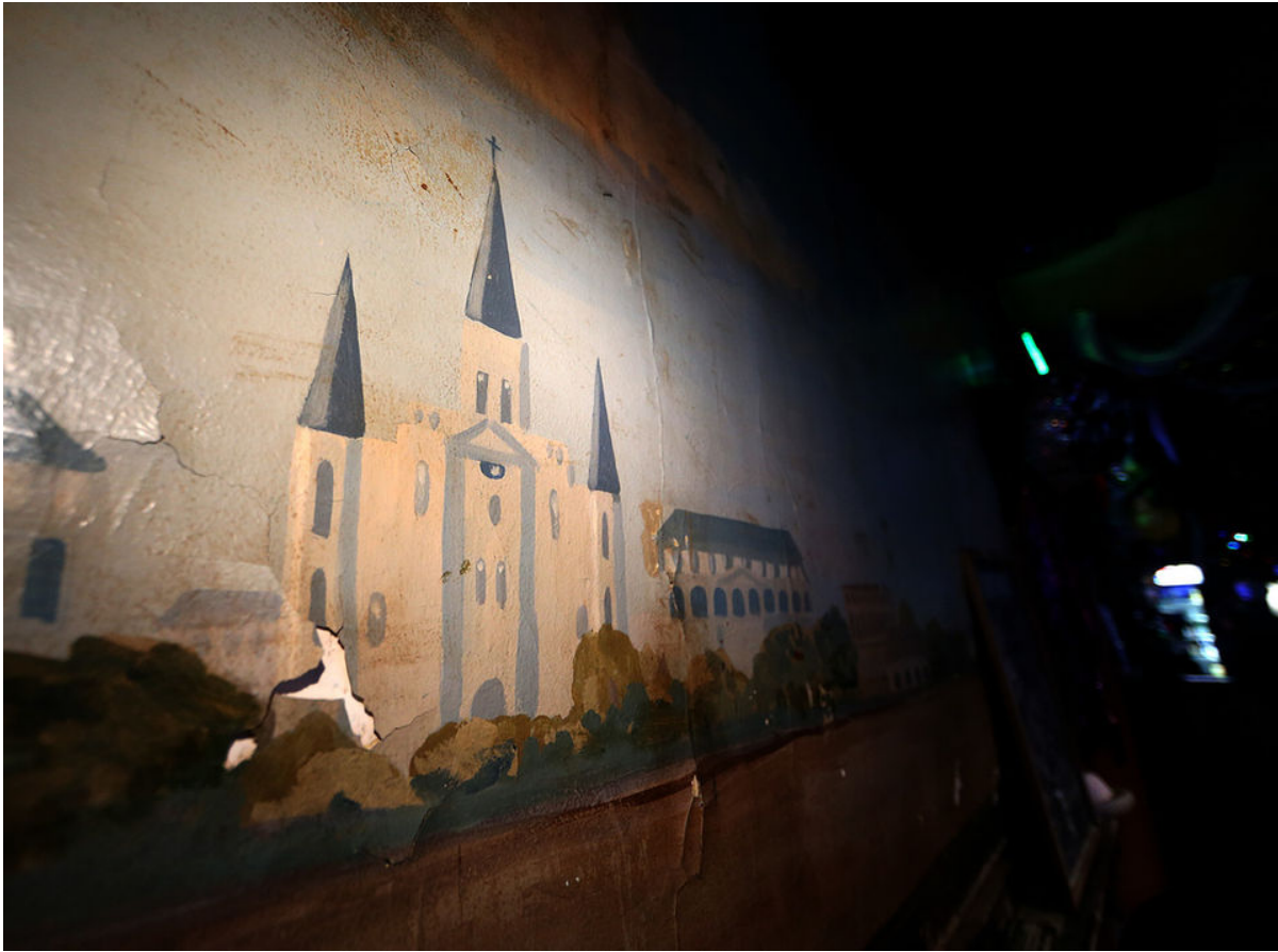
The mural on the wall at the Mayfair Lounge on Amelia Street. Photographed on Wednesday, October 3, 2018.